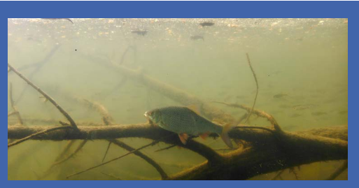
Roach with juvenile fish

The observation room is approximately 400 ft², and offers a glimpse into the Lahn's underwater world through windows facing into the Lahn and Fish Ladder. Visitors are able to observe fish migrations and aquatic life in a natural, pure environment. Several windows also look into shallower water demonstrating where young fish congregate to feed and find protection.